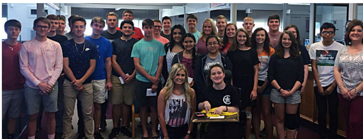
PHS SCHOLARSHIP RECIPIENTS

In May 2018 at the Foundation's Partners in Education awards ceremony, 99 high school seniors from Pisgah, Tuscola, Central Haywood, and Haywood Early College received 117 scholarships totaling $218,900. Scholarships ranged from $300 to $40,000.