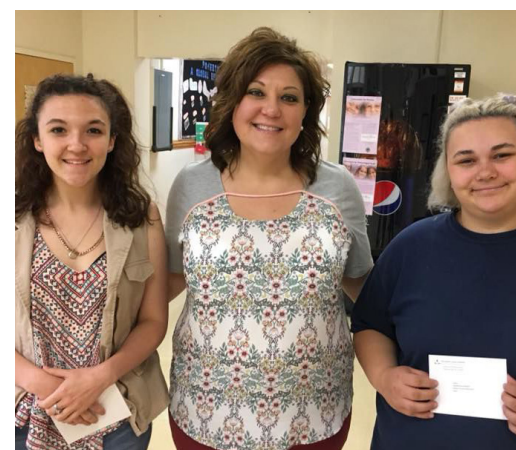
CHHS SCHOLARSHIP RECIPIENTS