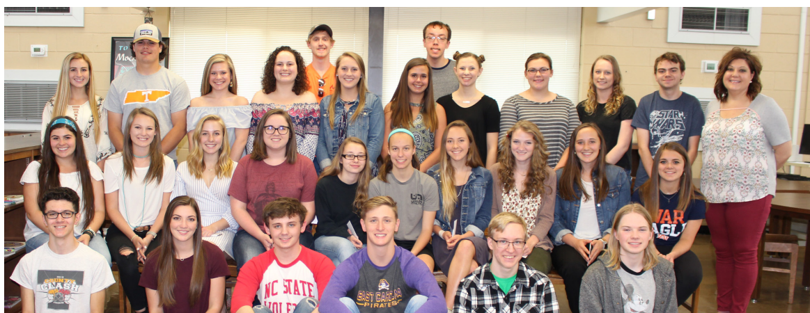
THS SCHOLARSHIP RECIPIENTS