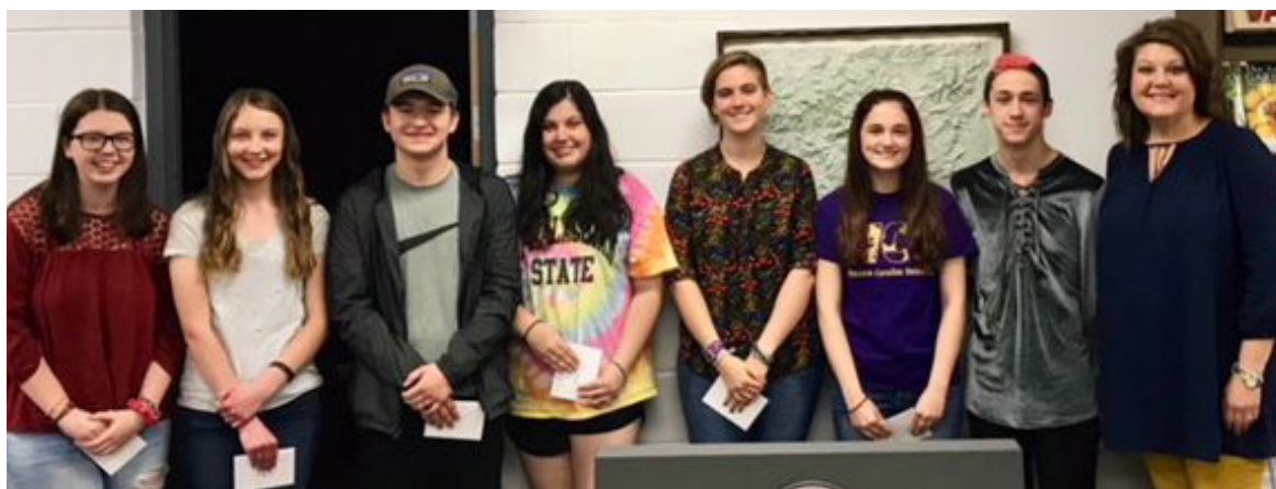
HAYWOOD EARLY COLLEGE SCHOLARSHIP RECIPIENTS

Currently, the Foundation manages more than 60 scholarships that have been established by businesses and individuals in the community. Scholarships may be endowed or funded annually.